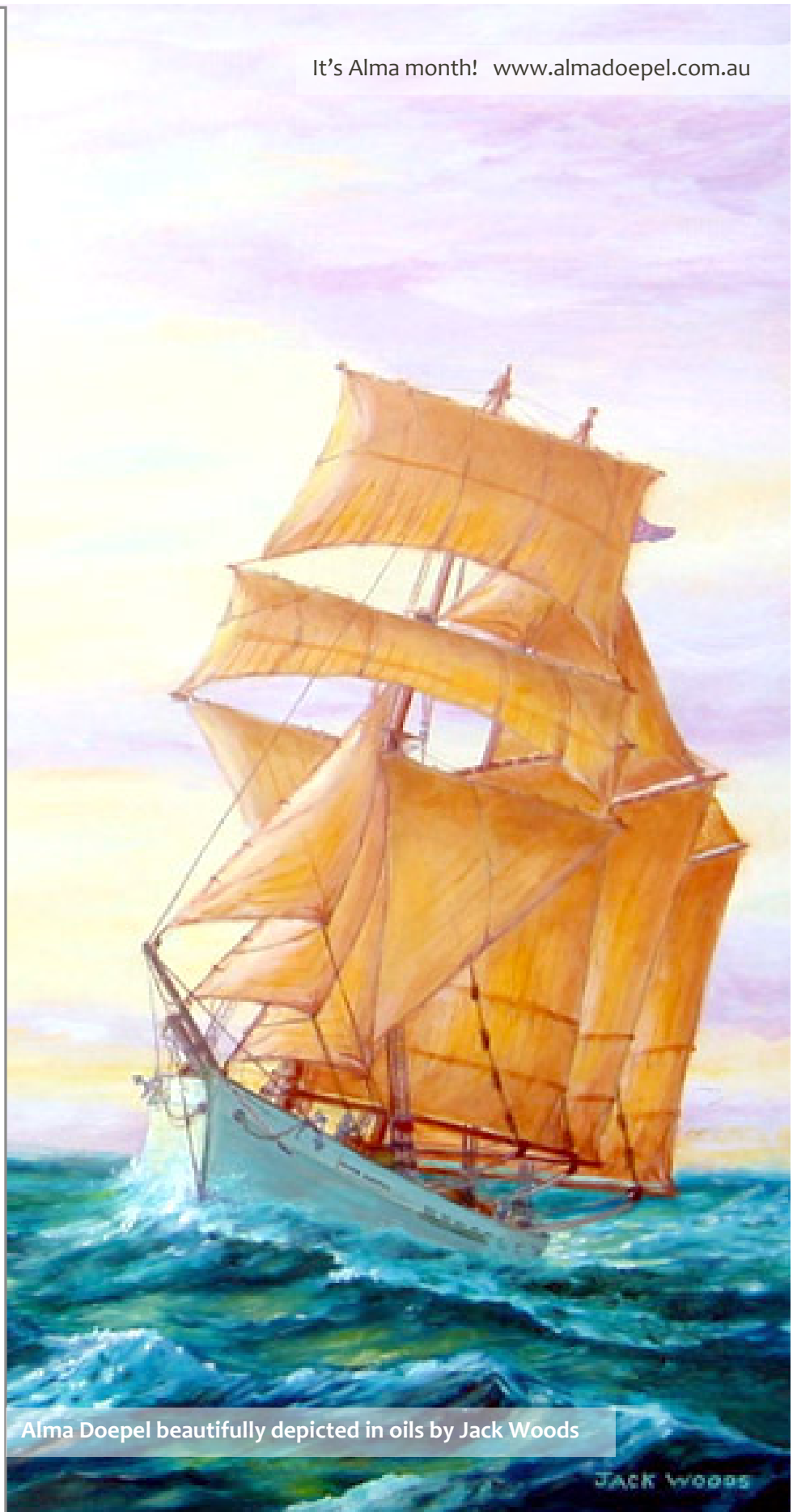
Alma Doepel beautifully depicted in oils by Jack Woods