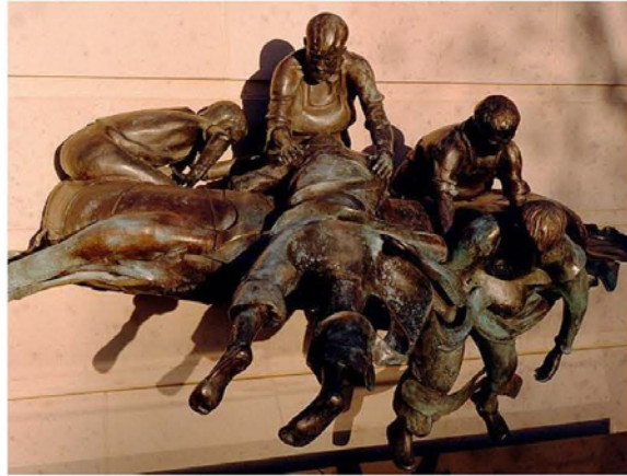
Merchant Navy Memorial Sculpture: Australian War Memorial, Canberra.