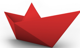
Iranian Crude Oil Exports to Europe