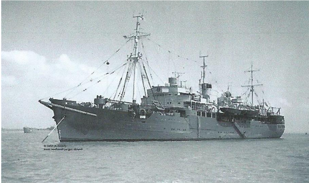
Bulolo as a Headquarters ship for amphibious landings

Bulolo was involved in the landings in North Africa, Sicily and Anzio and on D-Day was the command ship for the landing on Gold Beach.