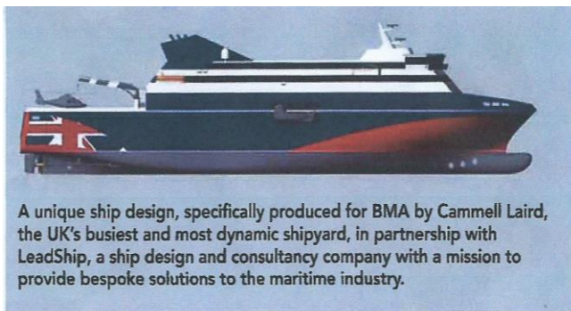
A unique ship design, specifically produced for BMA by Cammell Laird, the UK's busiest and most dynamic shipyard, in partnership with LeadShip, a ship design and consultancy company with a mission to provide bespoke solutions to the maritime industry.

With an overall target of 50% of the ship's company to be in training BMA aims to provide an invaluable and unforgettable experience for tomorrows youth.