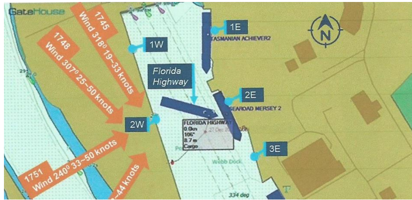
VTS AIS plot of Florida Highway orientation at about 1758

“Searoad Mersey 2” seeing what was happening started its engines and moved along the wharf until its stern was clear of the car carrier. The tugs arrived and the “Florida Highway” was secured to its berth.